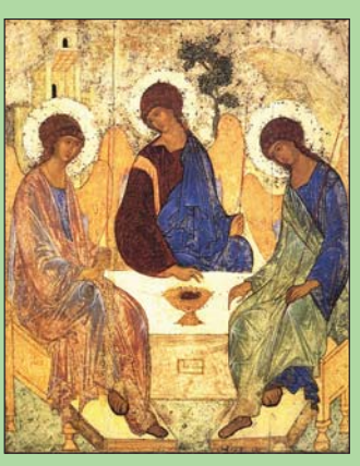
The Holy Trinity