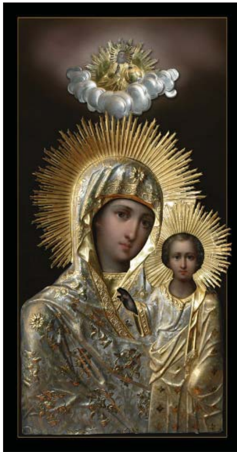
A 200-year heritage: The wonder-working Sitka Icon of the Mother of God, commissioned in the early 1800s by St. Innocent, visited many U.S. parishes in 2009.

In 1917 the Russian Revolution broke out. As a result, communications between the North American Diocese and the Church in Russia ceased. In the early 1920s the Patriarch of Moscow, [Saint] Tikhon – who from 1897 until 1907 had served as Bishop of the North